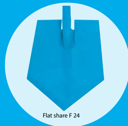
Flat share F 24

The Topas 140 is fitted with the point and wing combination from the renowned Lemken Smaragd stubble cultivator. All wear parts are bolted to the frog and maybe changed individually for low cost operation. The F 20 flat share converts the Topas 140 into a chisel type cultivator and is suitable for use in light to medium soils to provide primary loosening.